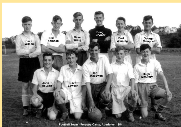
Football Team - Forestry Camp, Aberfoyle, 1954