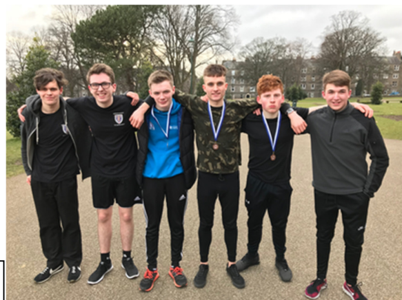
S5/6 Boys Team, Bronze Medalists

Modern Studies had a visit from, professor of Geography from NOVA College in Alexandria, Virginia to speak to the Higher pupils about the impact of rapid industrialisation on the landscape of China on Thursday. This continues our link up with NOVA College and D&A College and we are the only school in Dundee who has maintained this link every year.