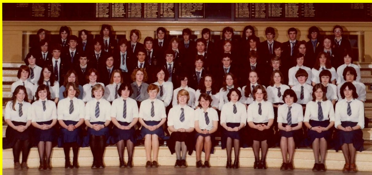
6 th Year 1977 – 1978